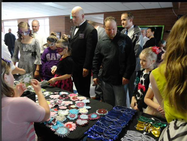
Dads and daughters selecting their boutonnières.