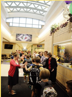
Great Teachers & Students