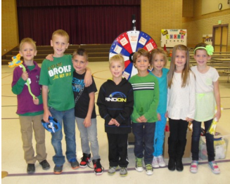
Wheel of Fortune Winners