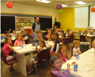
Lunch with the Principal