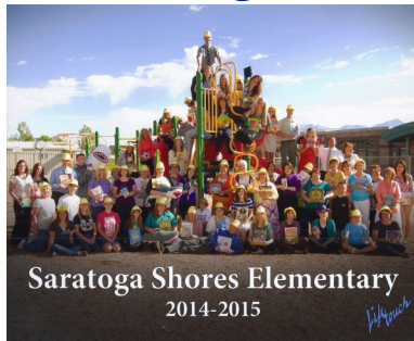
Saratoga Shores Elementary 2014-2015

- Ranked 5th out of 56 Alpine School District elementary schools for student academic growth!